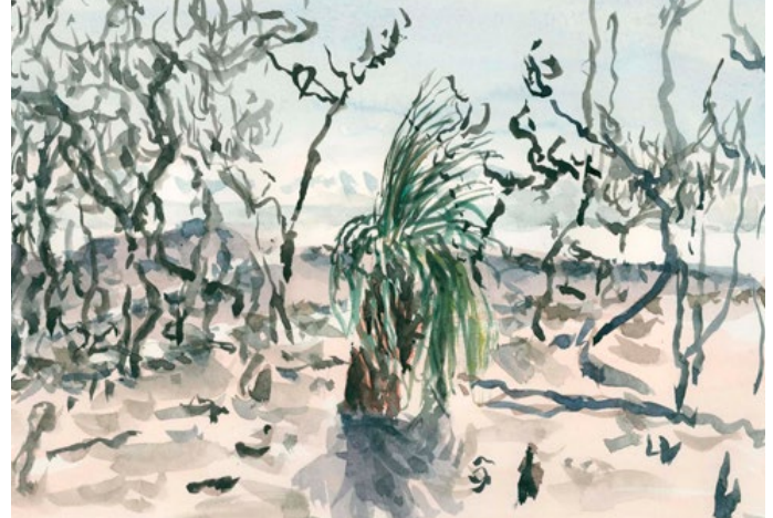
Tom Carment ink and watercolour, from the Cape Leeuwin to Cape Naturaliste walk, Western Australia. (Page 118)